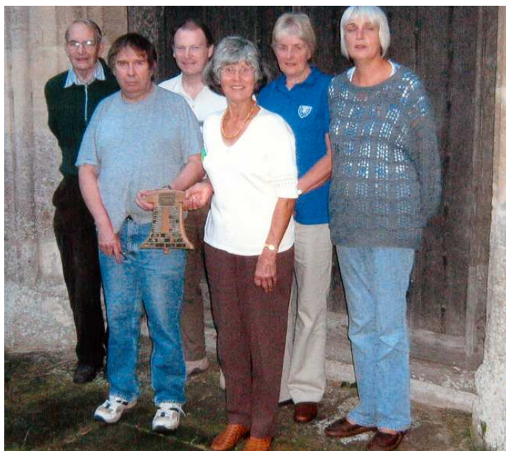
The winning team from Kersey

This years completion was held at Nayland on Saturday 28 th June. The sun shone and everyone milled about in the churchyard listening to the bells.