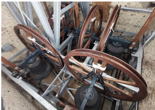
Troston: Re-hung on a new steel frame