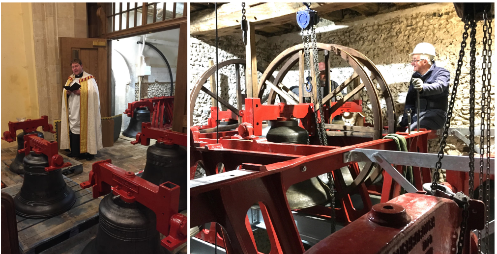
Hitcham—blessing and installation of the bells