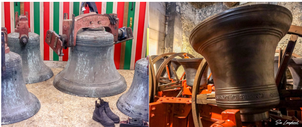
Sudbury St Gregory: Rehung with new headstocks and bearings